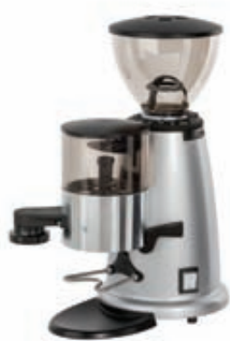
F4 Auto Silver

The F4 series models are manufactured from die-cast aluminium and finished in black, silver or polished chrome. Fitted with an integrated die cast dispenser, to suit different user requirements.