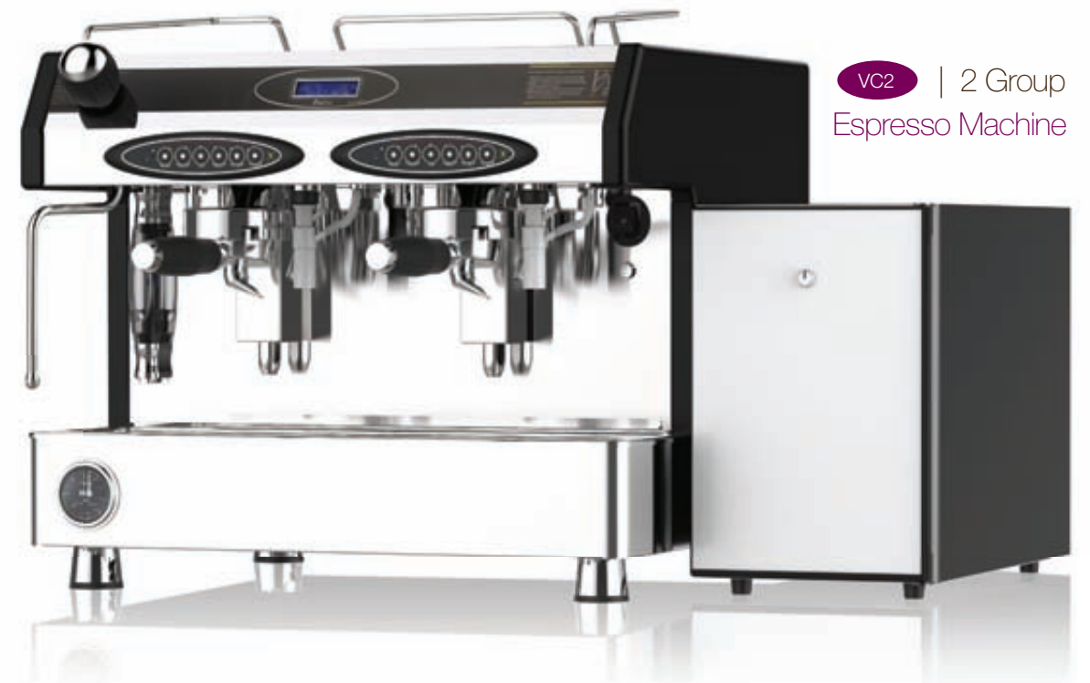
VC2 | 2 Group Espresso Machine