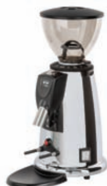
F4 OD Chrome

The F4 series models are manufactured from die-cast aluminium and finished in black, silver or polished chrome. The On Demand models feature a digital display allowing easy grind dose selection and adjustment.