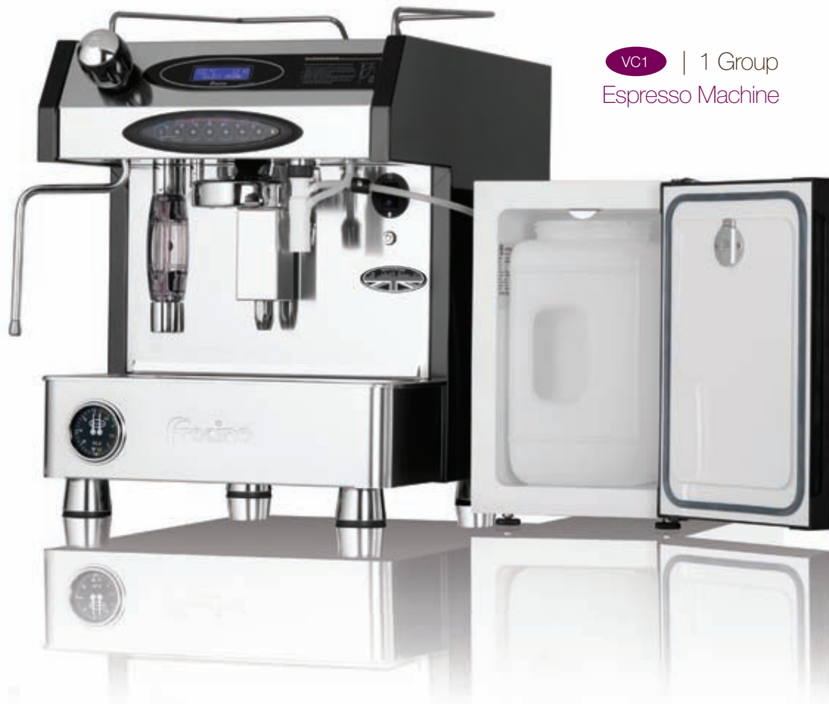
VC1 | 1 Group Espresso Machine

Introducing, the Velocino by Fracino, the state of the art hybrid espresso machine which pairs the convenience of a bean to cup machine, with the simplicity of a traditional espresso machine. Manufactured from the highest quality stainless steel, brass and copper components, it is a reliable and simple to maintain espresso machine, built to last a life time. This no nonsense new innovation has been specifically designed for sites with a high staff turnover, ensuring consistent, premium quality drinks each time, no matter how inexperienced the operator is. Combining the traditional E61 style chrome plated brass group with an automatic milk frother, advanced programming and an easy to understand control panel, the Velocino allows you to dispense all espresso based drinks straight into the cup at the press of a button.