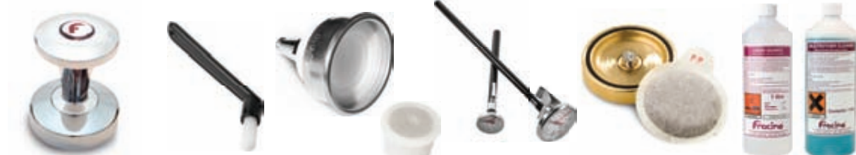
Stainless steel tampers Cleaning brush Capsule Adaptor Milk thermometers ESE Pod Conversion Kit Cleaning Detergent and Milk Cleaner

For other grinders and knock out drawers see: Fracino Grinder Brochure.